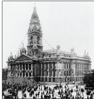
Portsmouth Town Hall, August 1905.