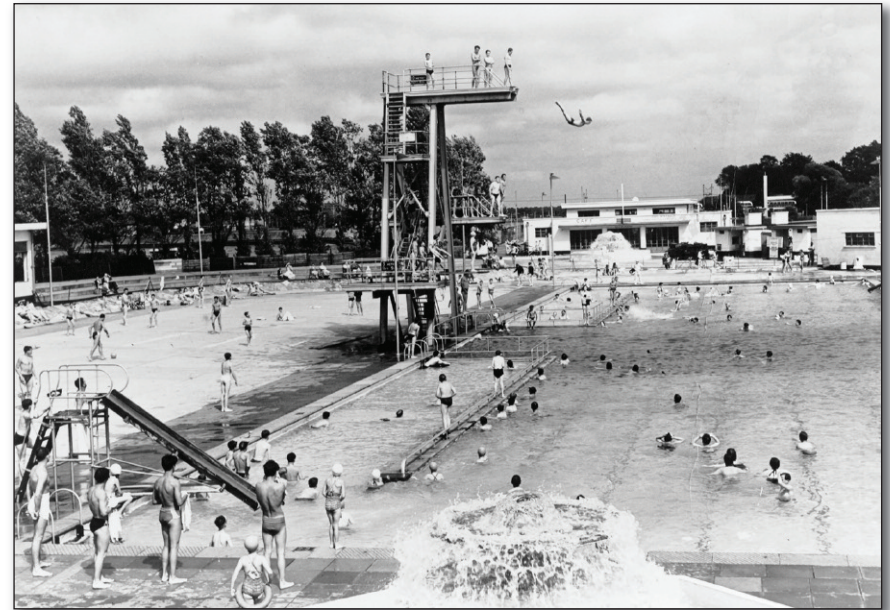
The adult pool at Hilsa Lido in 1959, showing diving tower, cascades at each end, and water chute.