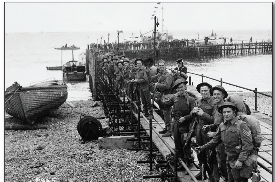
Troops leaving for Normandy in 1944 from South Parade Pier.