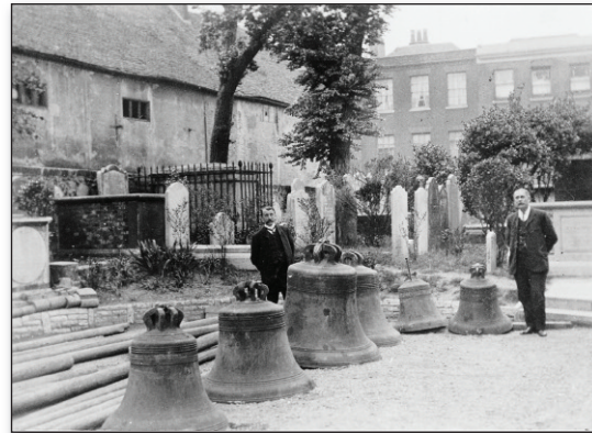
In 1912 the peal of eight bells in St Thomas' church tower were recast as part of the restoration of the structure.